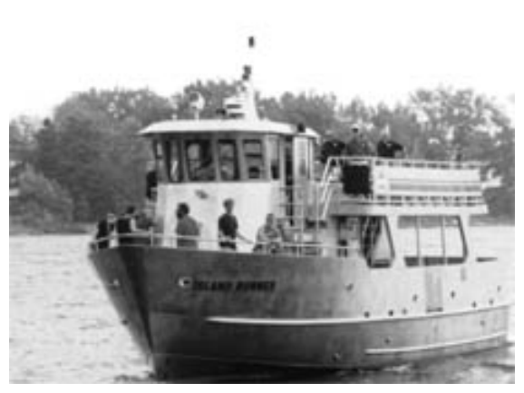
Island Runner passenger ferry