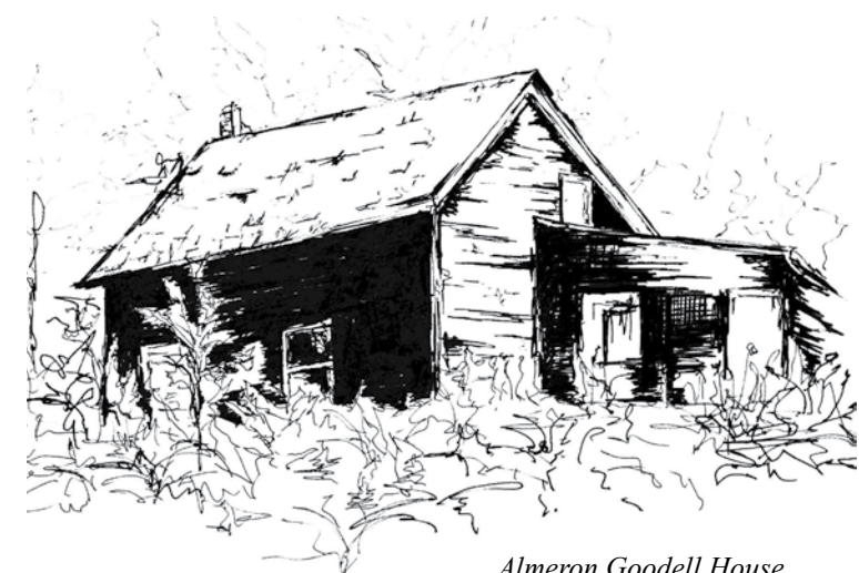
Almeron Goodell House